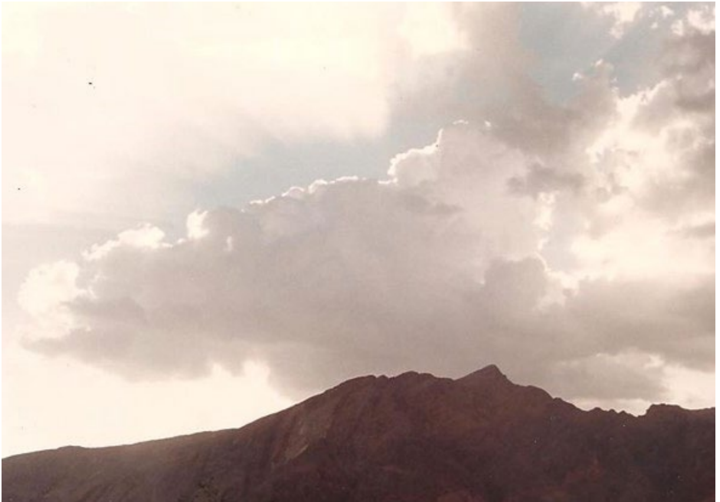
Cumulus Clouds over Al-Jebal Al-Akhdar near Izki 1987

A huge supply of water is floating in the atmosphere; a cumulus cloud may contain over two million litres of water.