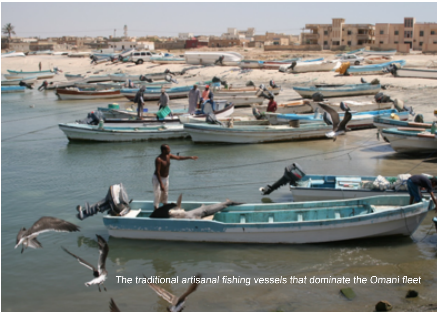
The traditional artisanal fishing vessels that dominate the Omani fleet

MacAlister Elliott & Partners is a UK based fisheries and aquaculture consultancy who have been active in Oman since the 1980s. Recent work has included feasibility studies in both the fisheries and aquaculture sectors.