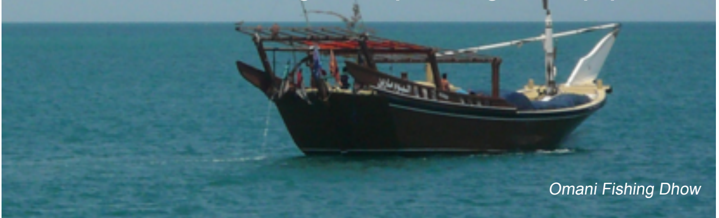
Omani Fishing Dhow

Oman has a coastline of 1,700 km stretching from the Yemeni border in the South to Musandam on the Straits of Hormuz in the North. Fishing is a well established activity providing food as well as a livelihood for a significant percentage of the population.