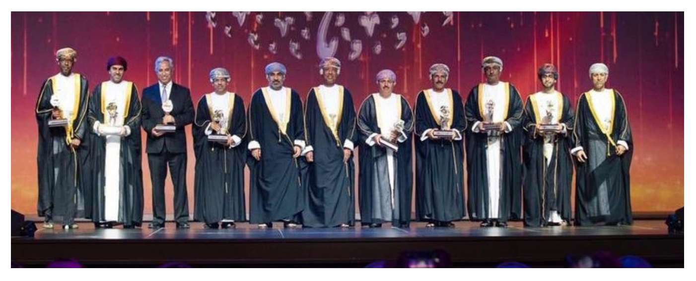
Edlal aims to contribute to the Oman's vision 2040 and become the leading platform of the e-learning industry in Oman and the region.

In addition, we were selected in the Arab Youth SDGs Report 2019 for contributing to the Sustainable Development Goals by providing quality education, decent work, economic growth and partnership to achieve SDGs.